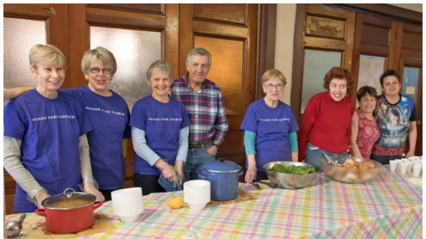
Our Faithful Team serving the hungry on 4-24-18